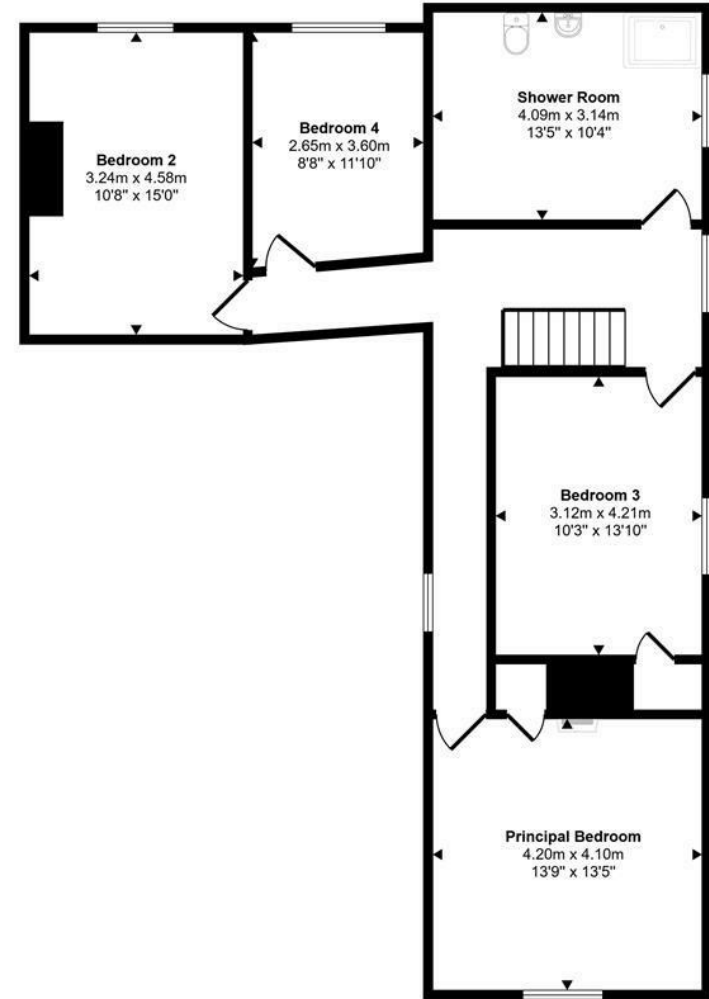
First Floor Approx 90 sq m / 967 sq ft

This floorplan is only for illustrative purposes and is not to scale. Measurements of rooms, doors, windows, and any items are approximate and no responsibility is taken for any error, omission or mis-statement. Icons of items such as bathroom suites are representations only and may not look like the real items. Made with Made Snappy 360.